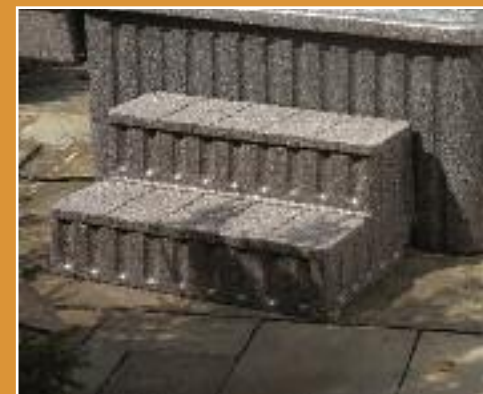
Matching Storage Steps Available!