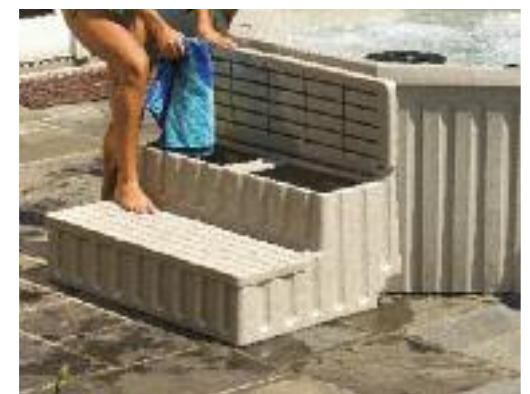
Matching Storage Steps Available!