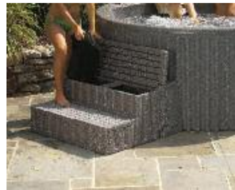
Matching Storage Steps Available!