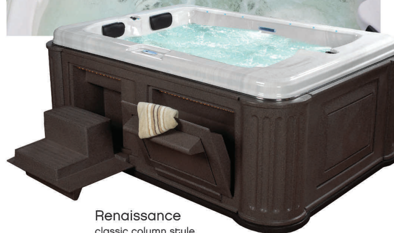
Renaissance classic column style

Strong's patented DuraLast™ cabinet comes in these beautiful designs, all with the industry's first lifetime warranty on the cabinet structure!