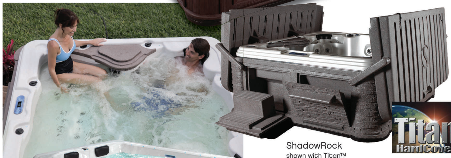
ShadowRock shown with Titan™ HardCover

not available with Titan™ Hardcover, stereo package, or step & towel holder feature (matching storage step included)